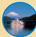
Ashinoko (Lake Ashi) Boat Cruise (twin-hulled)

※ Please note that there are very few buses servicing the route between Yugawara and Manazuru.