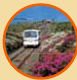
Jukkokutoge Cable Car