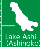
Lake Ashi (Ashinoko)