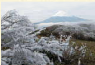
January Mt. Fuji and ice-glazed trees