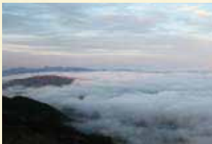
October A field of clouds