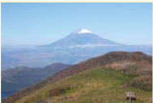
December Mt. Fuji on a clear day