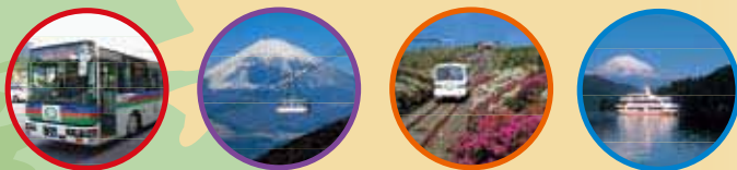
Izu Hakone Bus Komagatake Ropeway Jukkokutoge Cable Car Ashinoko (Lake Ashi) Boat Cruise (twin-hulled)

※ Please note that there are very few buses servicing the route between Yugawara and Manazuru.