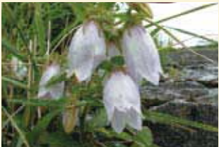
July Hotaru-bukuro bellflowers