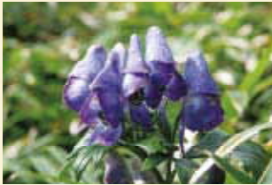
September Acotinum (monkshood)