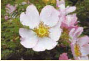
July Sansho-bara (Rosa hirtula)