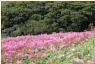
August Shimotsuke-so (Filipendula multijuga)