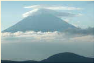
September Lenticular clouds over Mt. Fuji